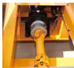
▶ Drum Brake applied