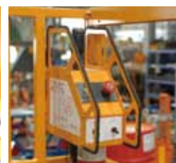
▶ Joystick provides precise and simultaneous travel control