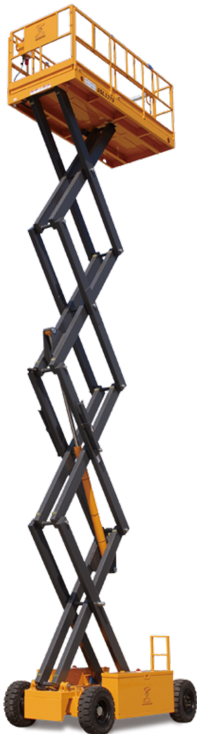
▲ SSL-3370 Max. Platform Height 10M (Max. Working Height 12M)

Designed for working in the high places such as building maintenance, machinery maintenance, construction, cleaning, and photography / cinematography / broadcasting shooting. Soosung's electric scissor lifts provide the most stable work platform for various applications.