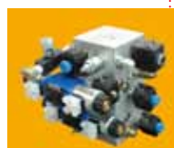
▶ Hydraulic Valve