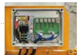
▶ Electric Control System